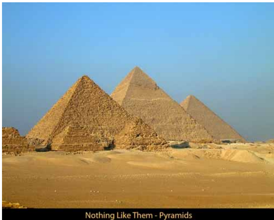
Nothing Like Them - Pyramids