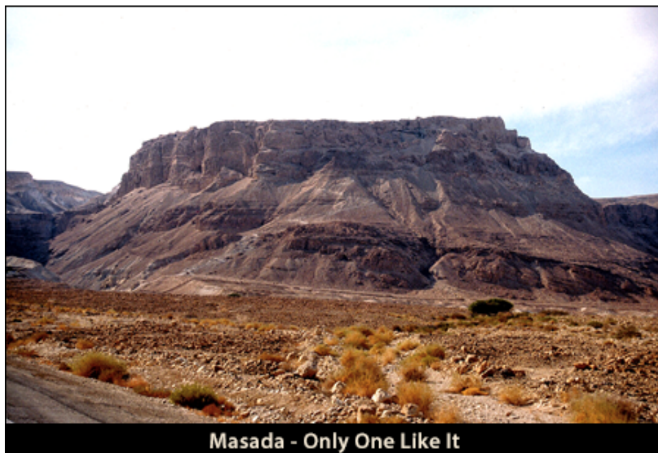
Masada - Only One Like It

No one else has existed before he or she came into existence