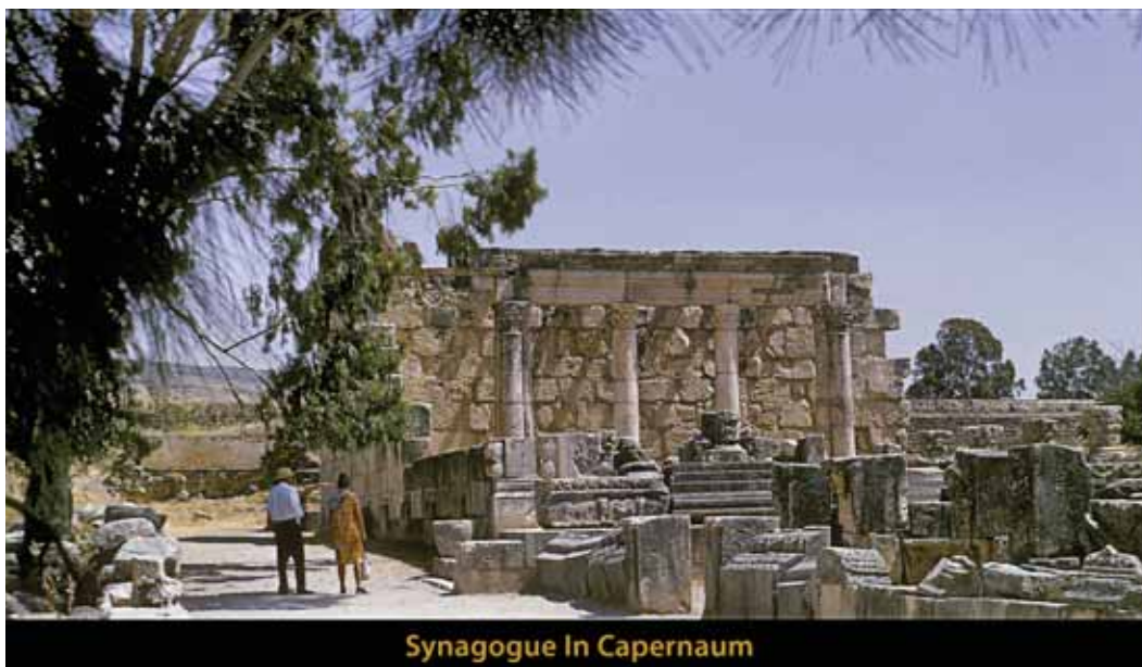
Synagogue In Capernaum

First, we are told that Jesus returned to Galilee in the power of the Holy Spirit. If we look closely at the gospels and the rest of the New Testament, we discover that Jesus was constantly filled with and guided by the Holy Spirit throughout His entire ministry, including His crucifixion (Luke 3:22; 4:1, 14, 18; 10:21; Acts 1:2; 2:22; 10:38; Heb. 9:14; Rom 8:11; 1 Pet. 3:18). He was under the control of the Holy Spirit in all that He did. That is, Jesus' pattern of life included "being