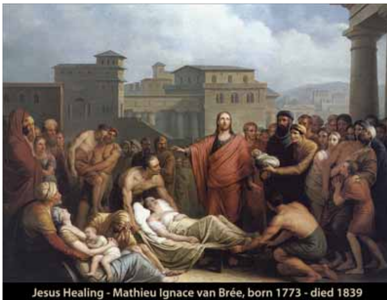
Jesus Healing - Mathieu Ignace van Brée, born 1773 - died 1839

JESUS WILL BE JUDGE. The religious leaders must have been furious by now, but Jesus was not finished.