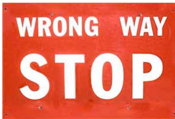
Is Your Divorce a Biblical Divorce?

The last reason was given to me some years ago by a young woman who felt rejected by her husband. She claimed to be a Christian. So when I asked her why she believed that it was okay to leave her husband, she said that 1 Cor. 7:12-15 gave her permission to divorce him. Here is the passage she referred to.