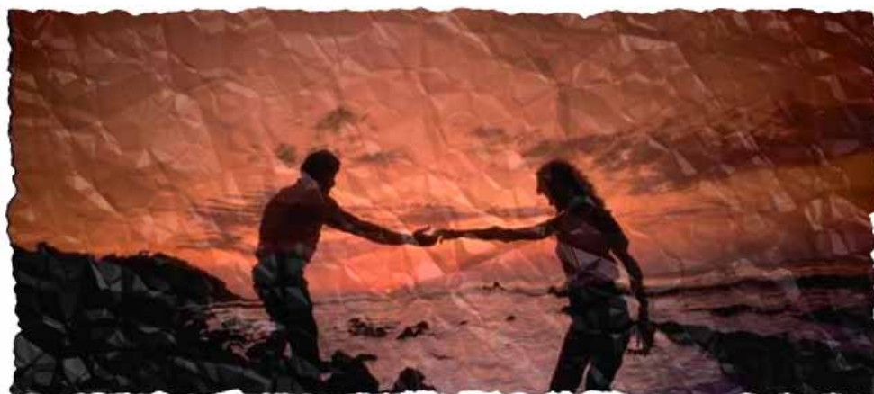
Divorce - A Shattered Marriage is Not God's Plan

IT WAS SAID. The religious leaders of His day did not value marriage, but God did. So Jesus said,