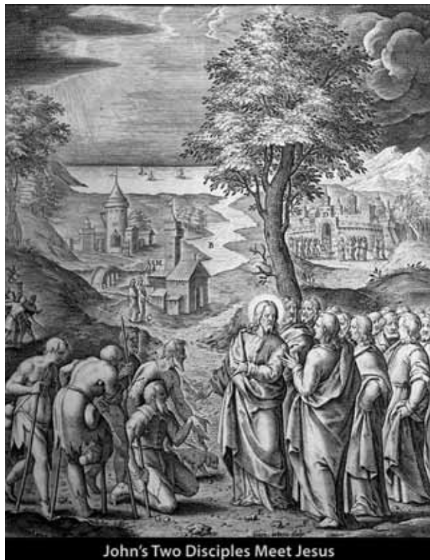
John's Two Disciples Meet Jesus

After John’s disciples were some distance away, Jesus asked the crowds, “What did you go out into the wilderness to see? A reed shaken by the wind?” The Greek word that Jesus used for “to see” comes is THEOMAI. The word refers “to observing closely something that is very unusual.” Jesus knew that the crowds had come not just to see John the Baptist. They had