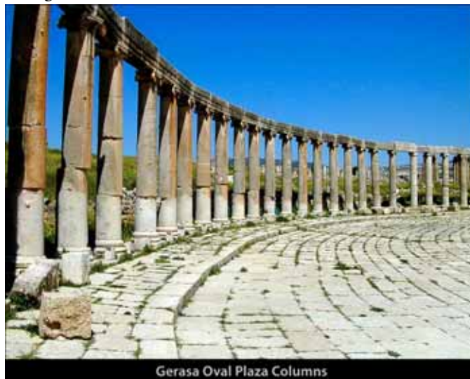
Gerasa Oval Plaza Columns

Why did he ask not to be tormented? The answer is hinted at by the gospel of Luke, where we are told the demon's name was Legion and that he asked not to be sent to the abyss.