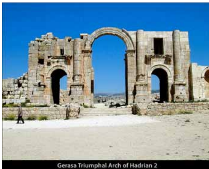
Gerasa Triumphal Arch of Hadrian 2

Why were these events recorded for us after the religious leaders announced to the crowd that Jesus was demon-possessed? The answer is that this event was not a tutorial