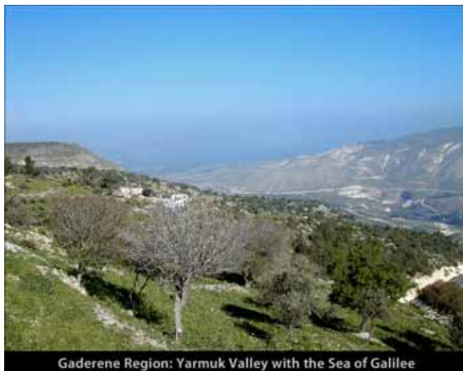
Gaderene Region: Yarmuk Valley with the Sea of Galilee

The gospel of Luke tells us that the country of the Gadarenes