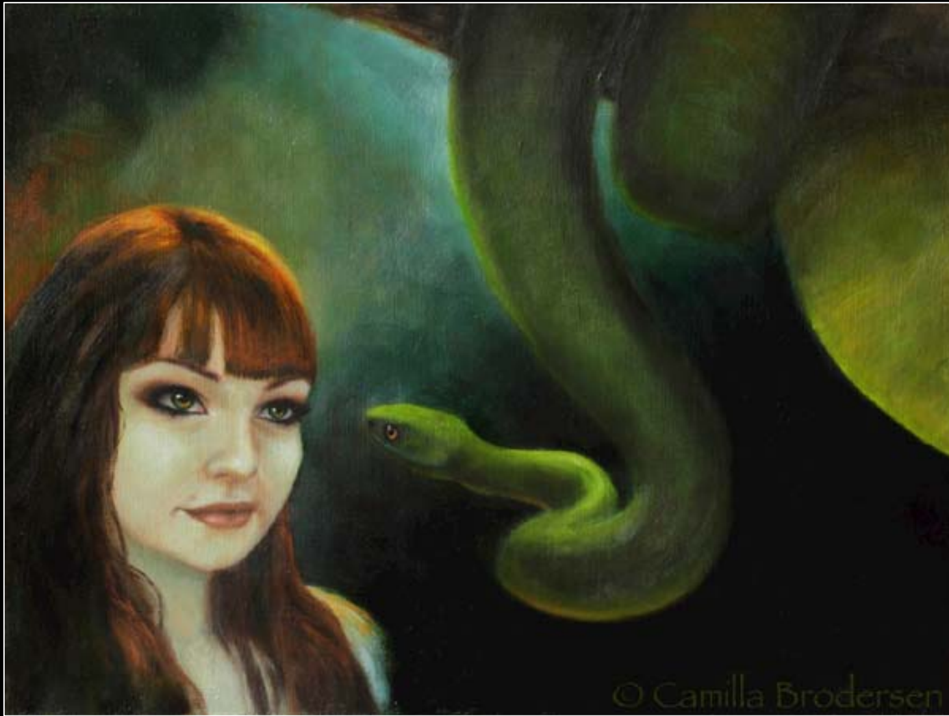
Serpent and Eve