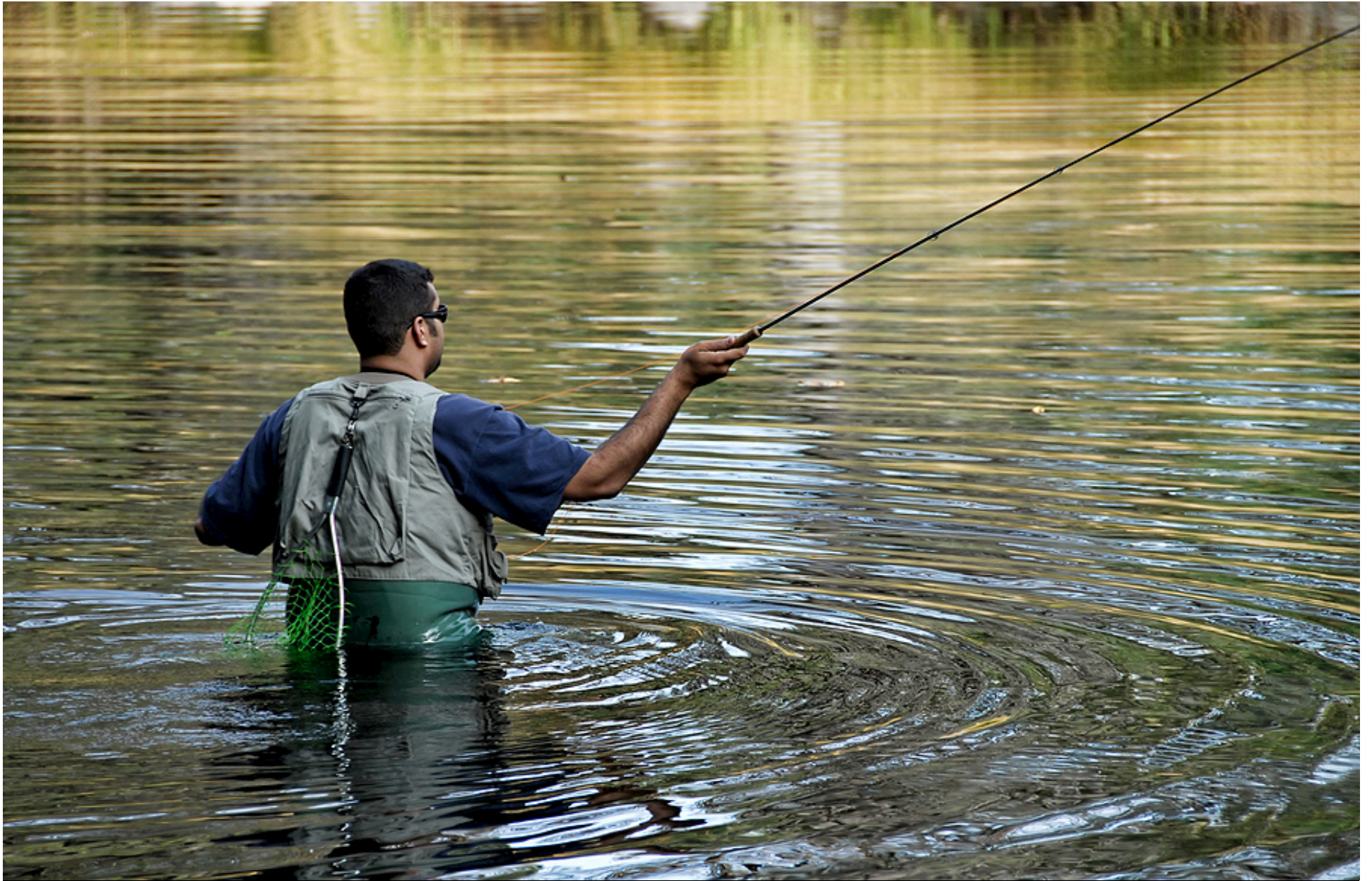
Picture of Fishing