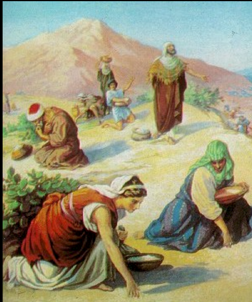
Israelites Gather Manna & Quail