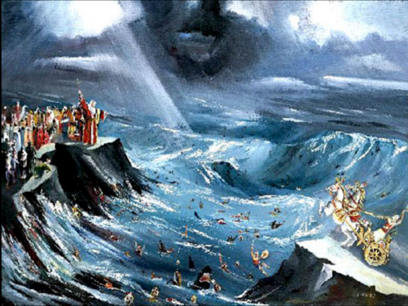
Israelites Cross The Red Sea