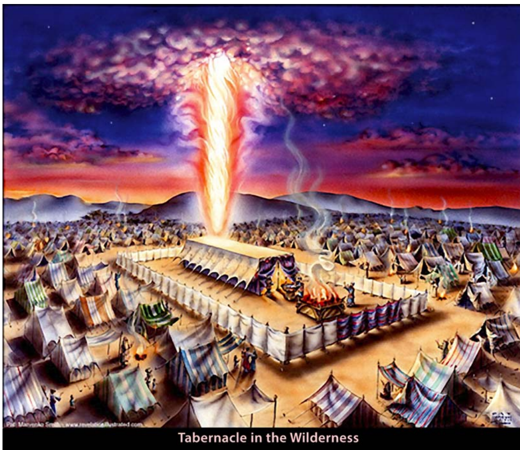
Tabernacle in the Wilderness

Then the temple which is in heaven will open and seven angels who had the seven plagues will appear.