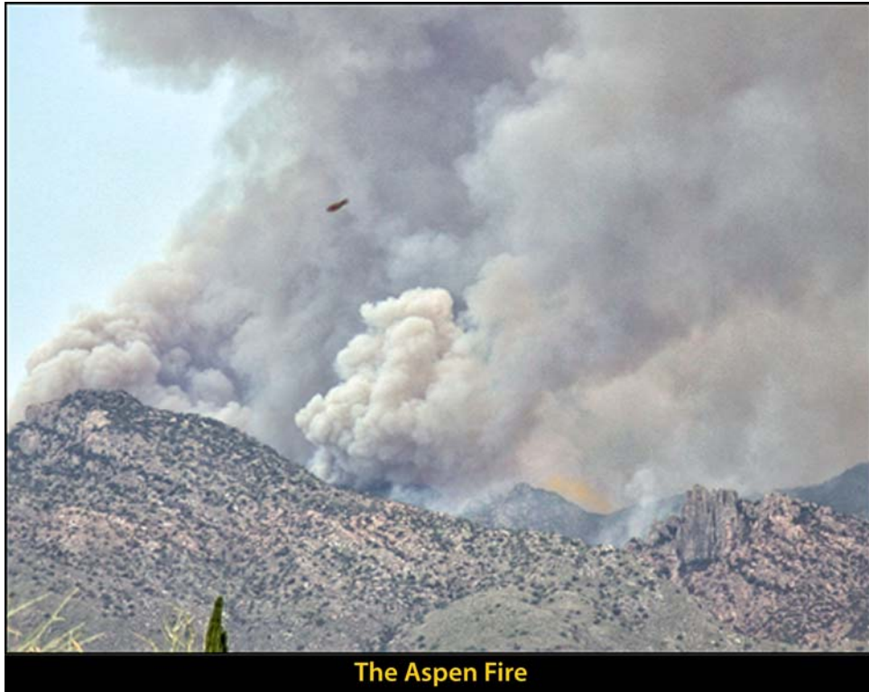
The Aspen Fire

the smoke is associated with God's glory. There is something mysterious and wonderful about God which we do not understand. His glory is awesome, unusual, mysterious and captivating. The Apostle John saw the smoke from His glory. Please Lord show us more of your glory!