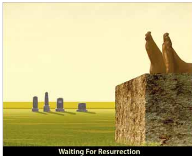
Waiting For Resurrection

In the New Testament, the apostle Peter declared that the prophecy was fulfilled in Jesus Christ. Here is his statement.