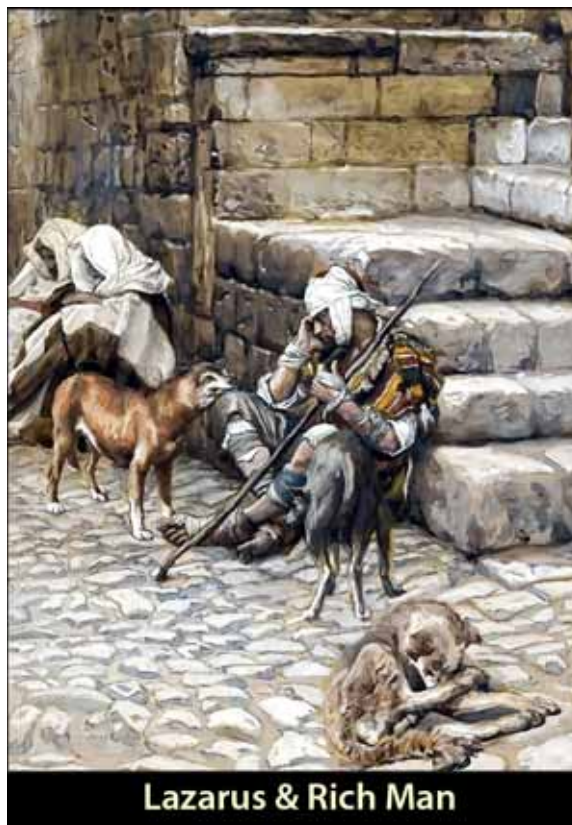
Lazarus & Rich Man

Hebrews 12:23 and 2 Peter 3:13 indicate that the saints will go to heaven.