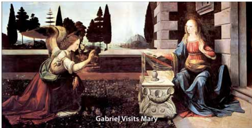
Gabriel Visits Mary

No, that is not that the way it happened. The angel just